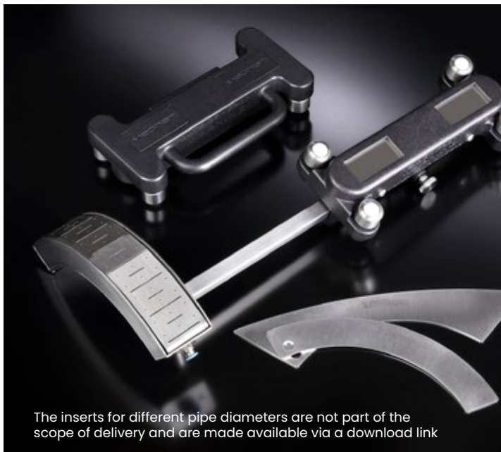
The inserts for different pipe diameters are not part of the scope of delivery and are made available via a download link