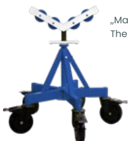
„Maxi Flex“ The mobile Pipe Jack Stand

Useful tools from DWT: Pipe Jack Stands for pipe handling.