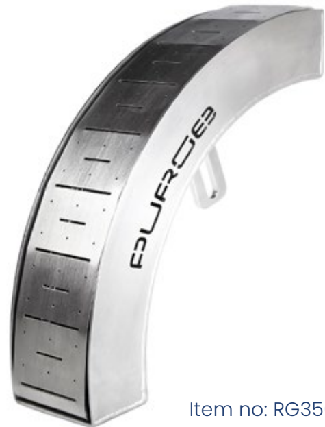
Item no: RG350230