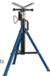
„Pipe Jack Stand foldable“ Also with various roller heads available

Many solutions for Pipe Edge Preparation Find out about our other products