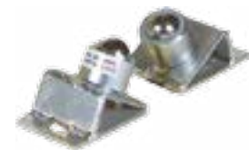
Stainless steel transfer heads